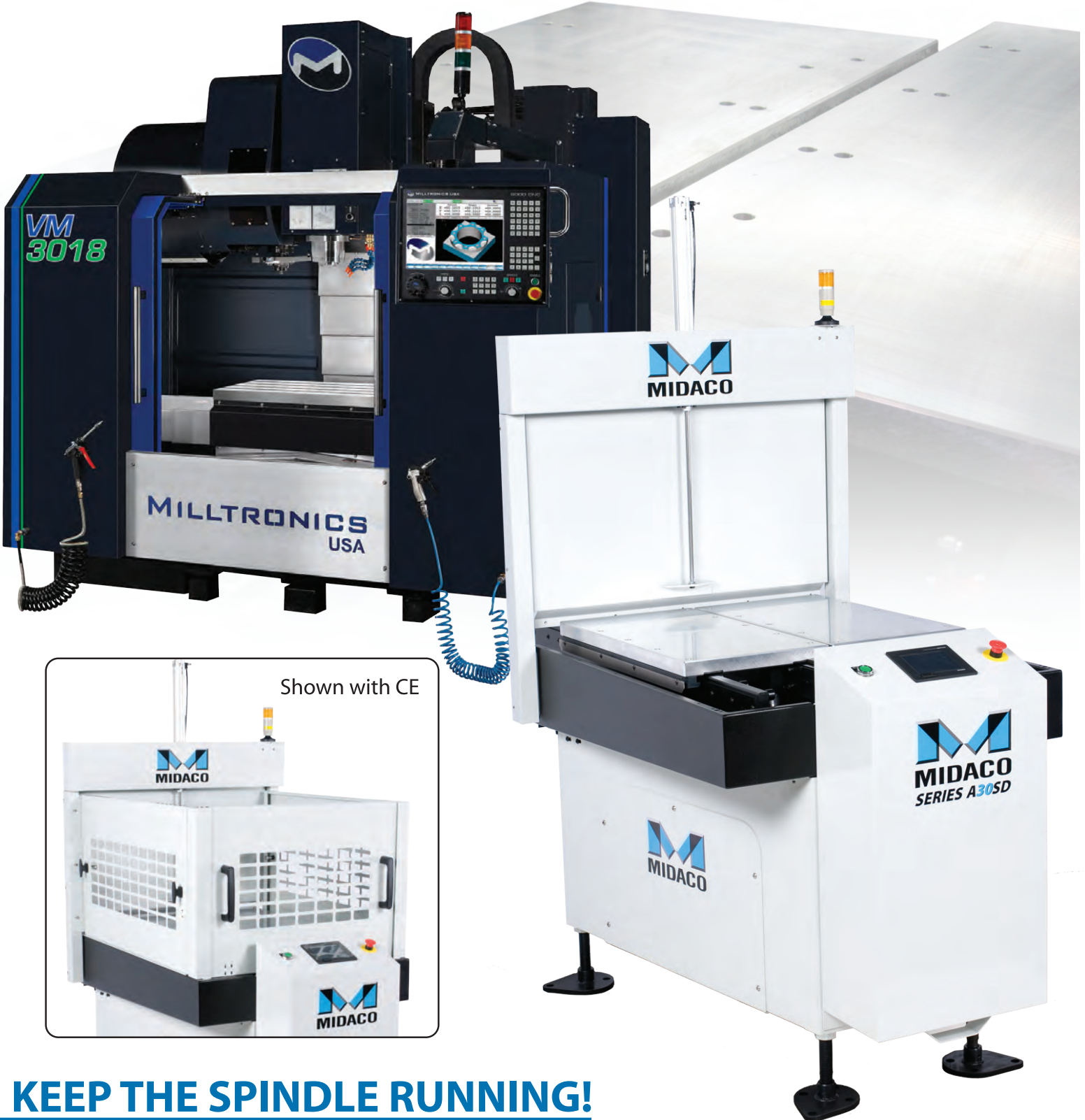
Shown with CE