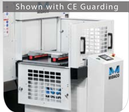
Shown: Automatic Series 16SD